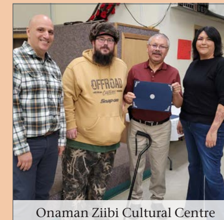
Onaman Ziibi Cultural Centre