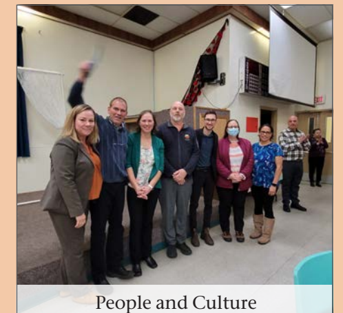
People and Culture