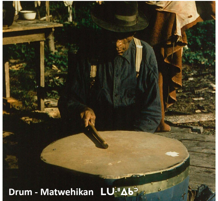
Drum - Matwehikan ᑭᑭᑦ ᑭᑭᑦ