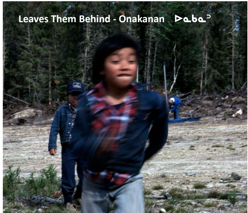
Leaves Them Behind - Onakanan ᑭᑭᑦ ᑭᑭᑦ