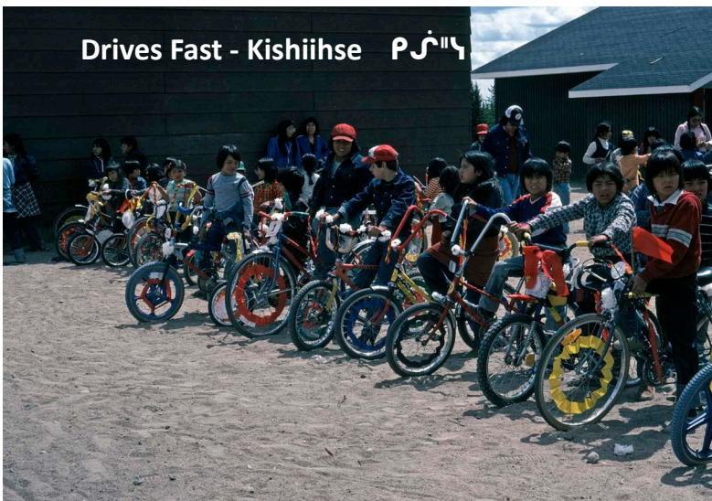
Drives Fast - Kishihse ᑭᑭᑦ ᑭᑭᑦ